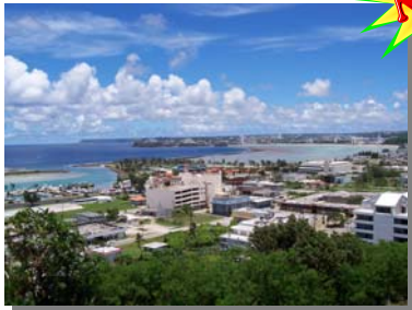
2 Nights in Guam with Diving