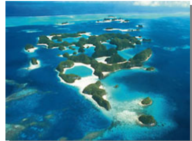
7 Nights Liveaboard in Palau

If you've been dreaming of diving the South Pacific and your vacation schedule just won't let you be gone for 2 full weeks, we have a great option available so you can fulfill that dream. Our optional Guam/Palau package gets you to the heart of the South Pacific and back in 11 days with the return on a Saturday so you have the weekend to relax. That's only 8 work days off and still have a fantastic 10 days of 30+ dives in the South Pacific.